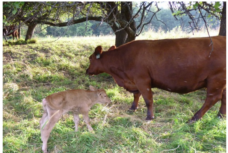
Figure 1. First Akaushi sired calf born at UPREC

In keeping with the goal of increasing overall backfat and marbling of grass finished cattle, one half of the herd was artificially inseminated to Wagyu bulls in November of 2016. Wagyu ("Japanese cow") is any of four Japanese breeds of beef cattle which are genetically predisposed to intense marbling and to producing a high percentage of oleaginous unsaturated fat. Akaushi (Japanese Brown breed of Wagyu cattle) semen was purchased from HeartBrand Beef of Flatonia, TX ( www.heartbrandbeef.com ). The first of 38 Akaushi/Red Angus crossed calves, arrived on August 13, 2017. The crossbred calves had an average birth weight of 81.7 pounds compared to 79.5 pounds for their straightbred Red Angus contemporaries. These calves will be harvested and carcass data collected the fall of 2019. Stay tuned for more on this exciting new project happening at Chatham.